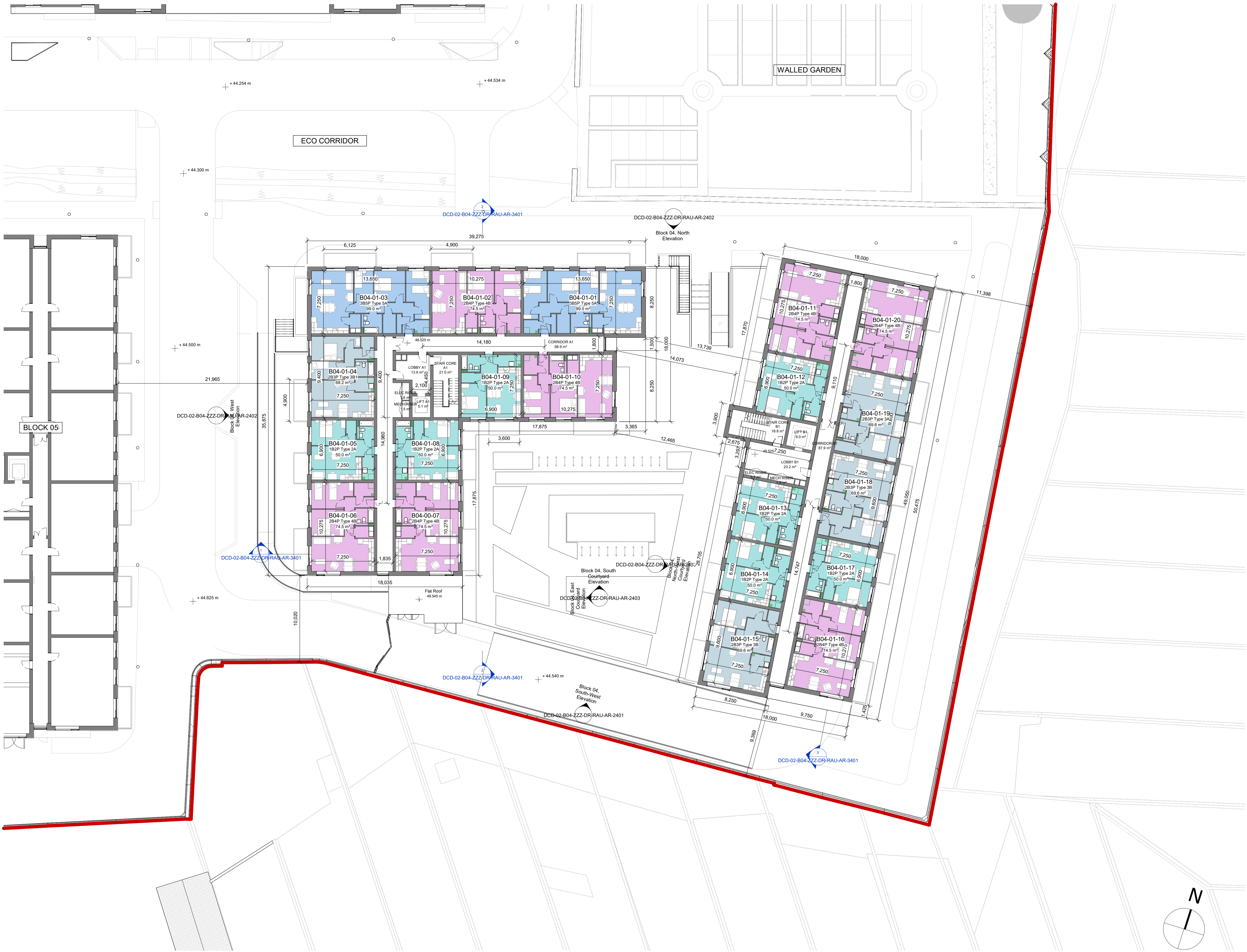
L01 Block 04, First Floor Level 1 : 200

Notes: - Do not scale from this drawing. Use figured dimensions in all cases. - Verify dimensions on site and report any discrepancies to the Architect immediately. - This drawing is to be read in conjunction with the Architect's Specification. - © This drawing is copyright and may only be reproduced with the Architect's permission.